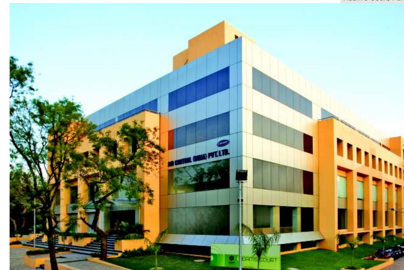
Adam's Court, Pune

a) According to the explanation and information given to us, the Company has not granted any loans or advances on the basis of security by way of pledge of shares, debentures and other securities.