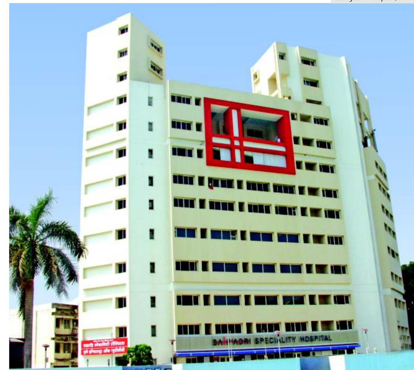
Sahyadri Hospital, Pune