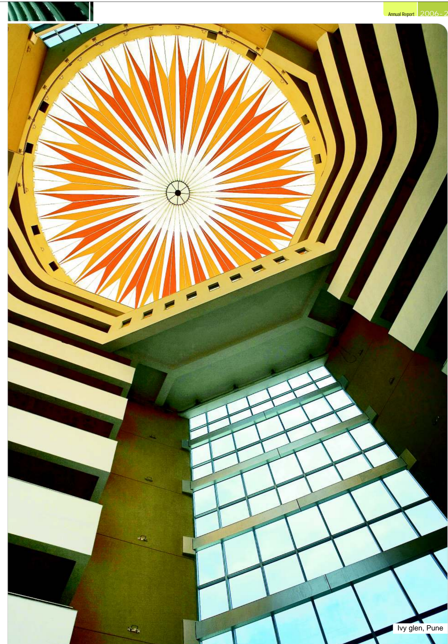
Ivy glen, Pune